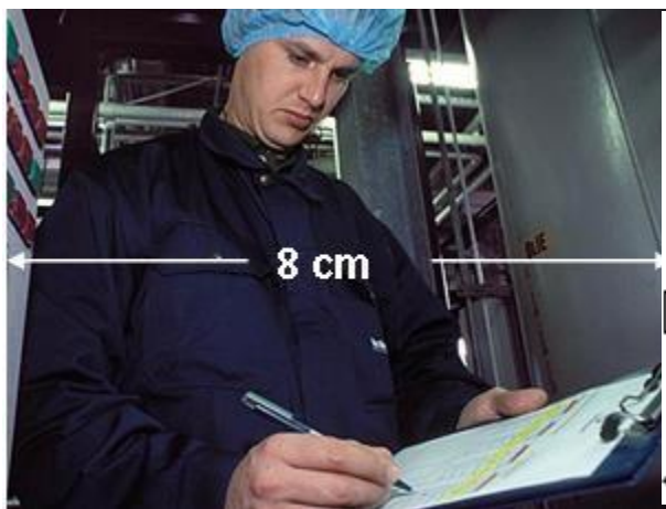
Figure 1. Taking a lubrication survey